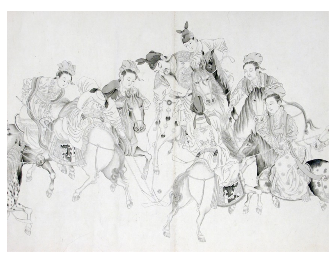
04 | (detail)