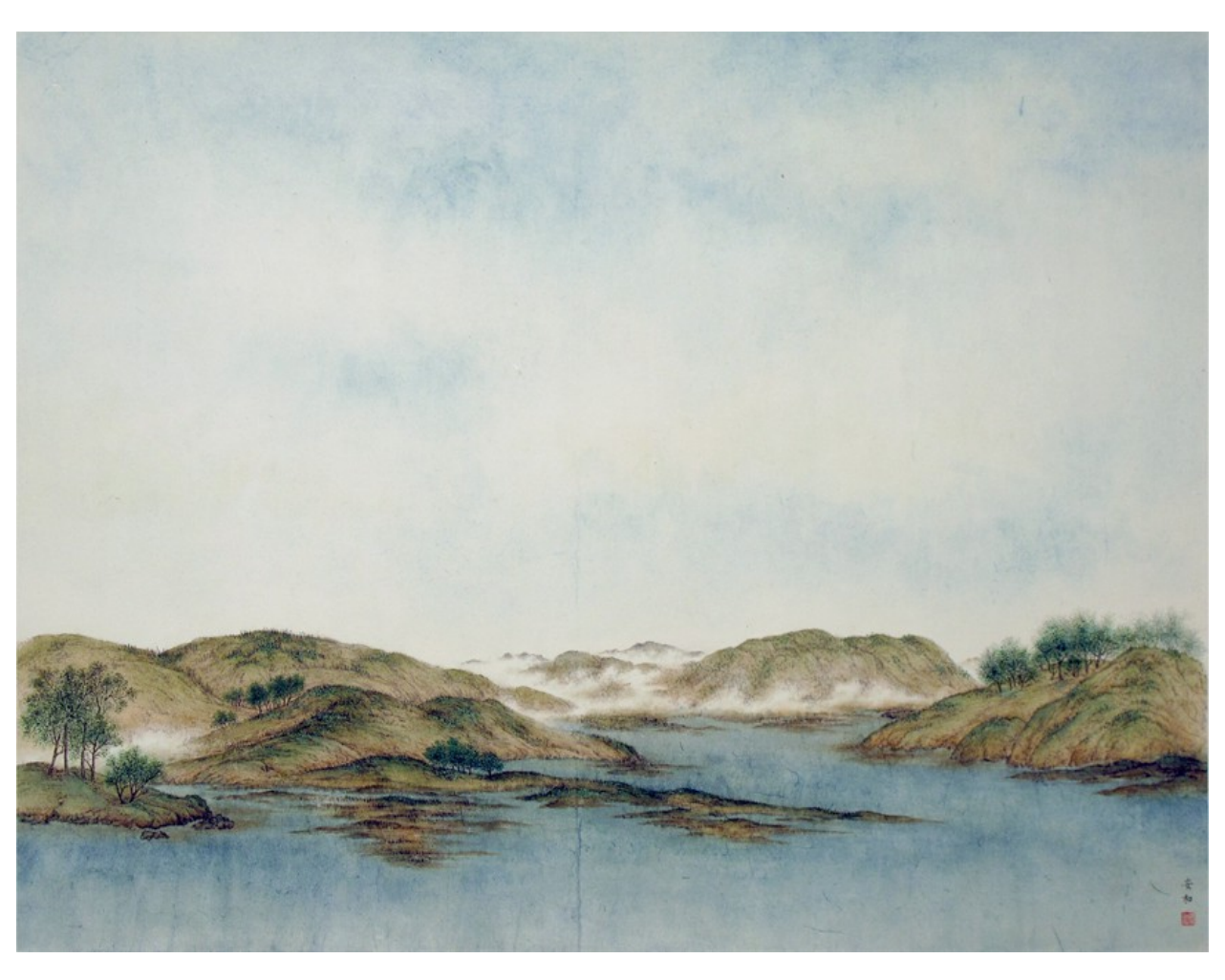
09 | An Ho (b. 1927), LANDSCAPE, 2008, Ink and color on paper, 23.25 x 30.125 in [59.1 x 76.5 cm]