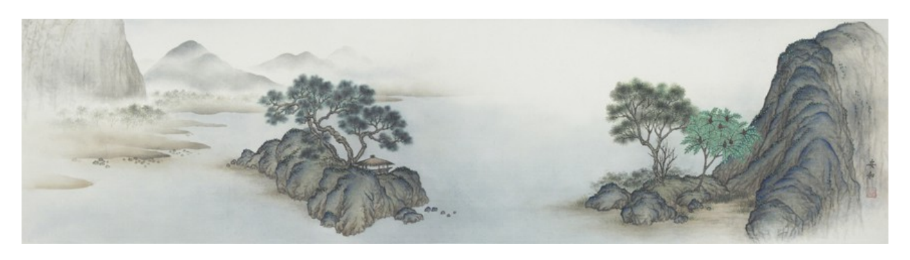
15 | An Ho (b. 1927), MOUNTAINS AND WATER, 2014, Ink on color on silk, framed, 7.25 x 28 in [18.4 x 71 cm]