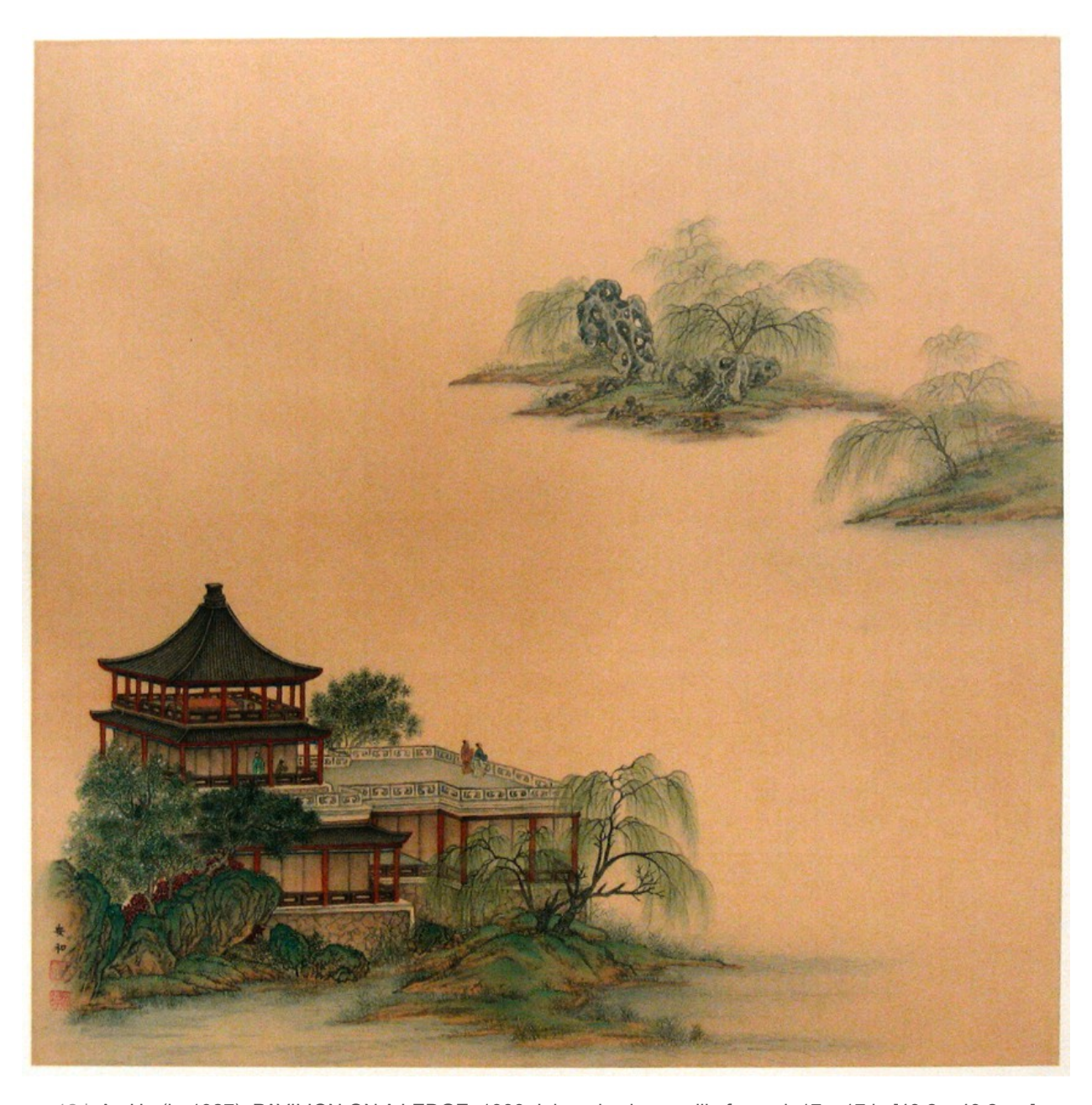
| An Ho (b. 1927), PAVILION ON A LEDGE, 1999, Ink and color on silk, framed, 17 \times 17 in [43.2 x 43.2 cm]