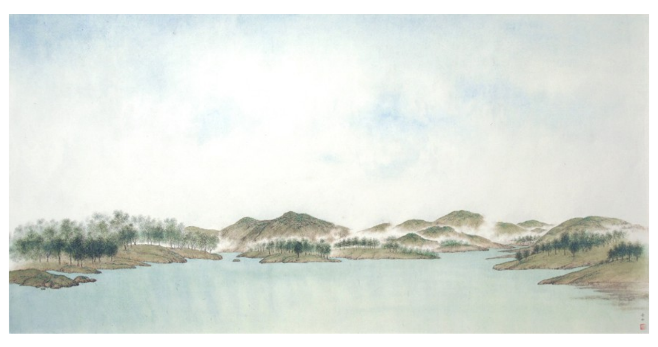
10 | An Ho (b. 1927), MOUNTAIN MIST NEAR WATER, 2007, Ink and color on paper, 20 x 40 in [50.8 x 101.6 cm]