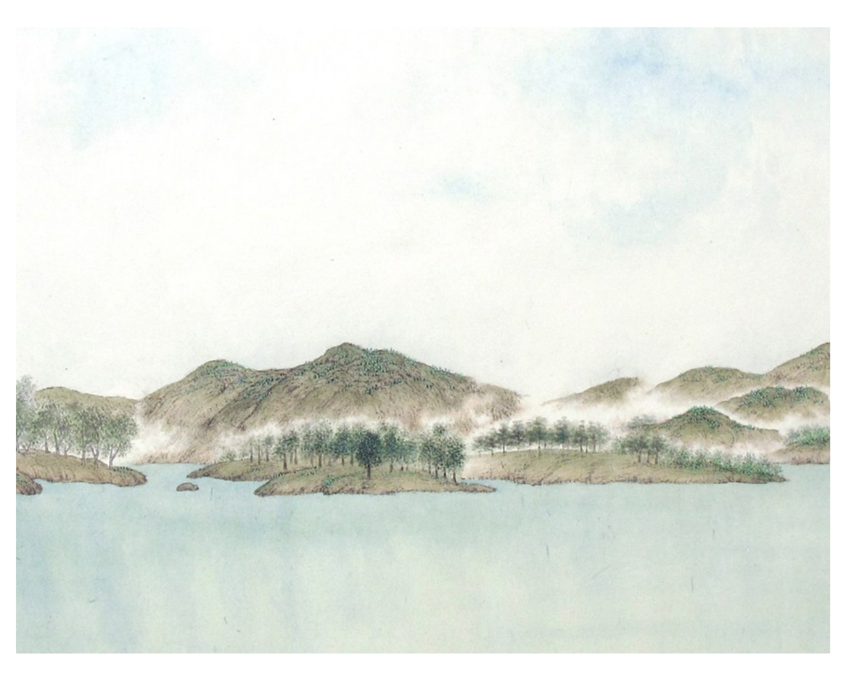
10 | (detail)