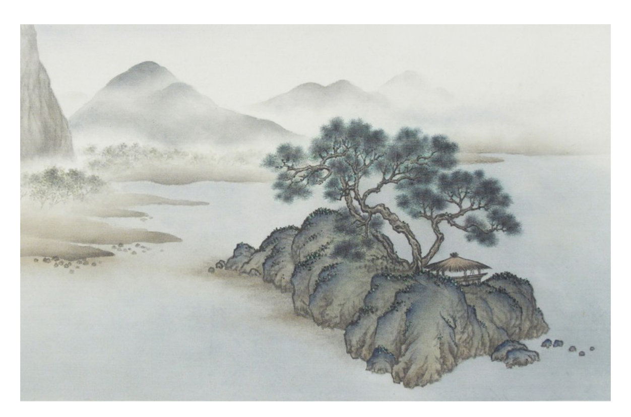
15 | (detail)