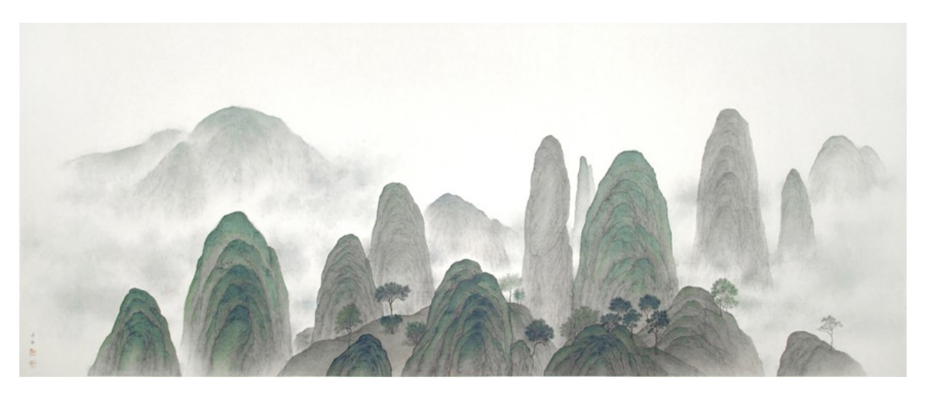
11 | An Ho (b. 1927), MOUNTAIN LANDSCAPE, 2010, Ink and color on silk, 29 x 72.625 in [73.66 x 184.4 cm]