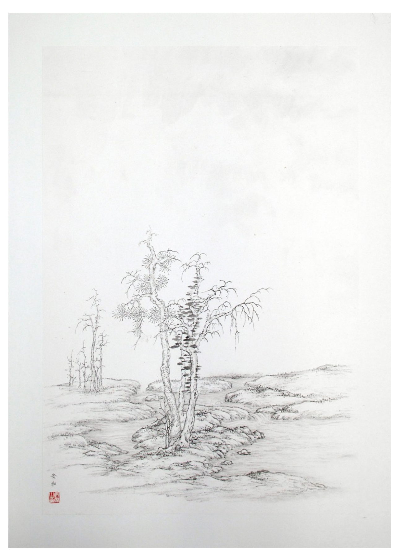
13 | An Ho (b. 1927), TREE, 2007, Ink on paper, framed, 25 x 17 in [63.7 x 43.2 cm]