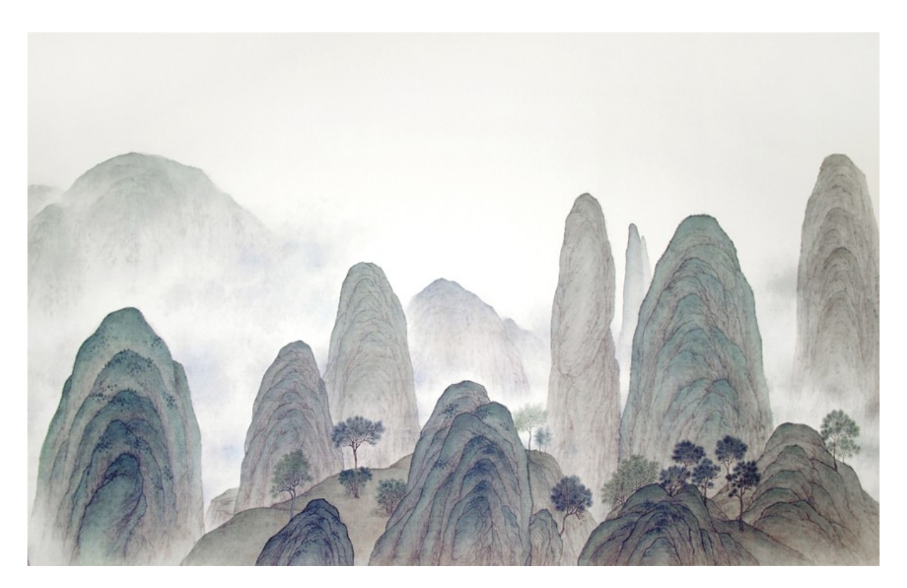
11 | (detail)