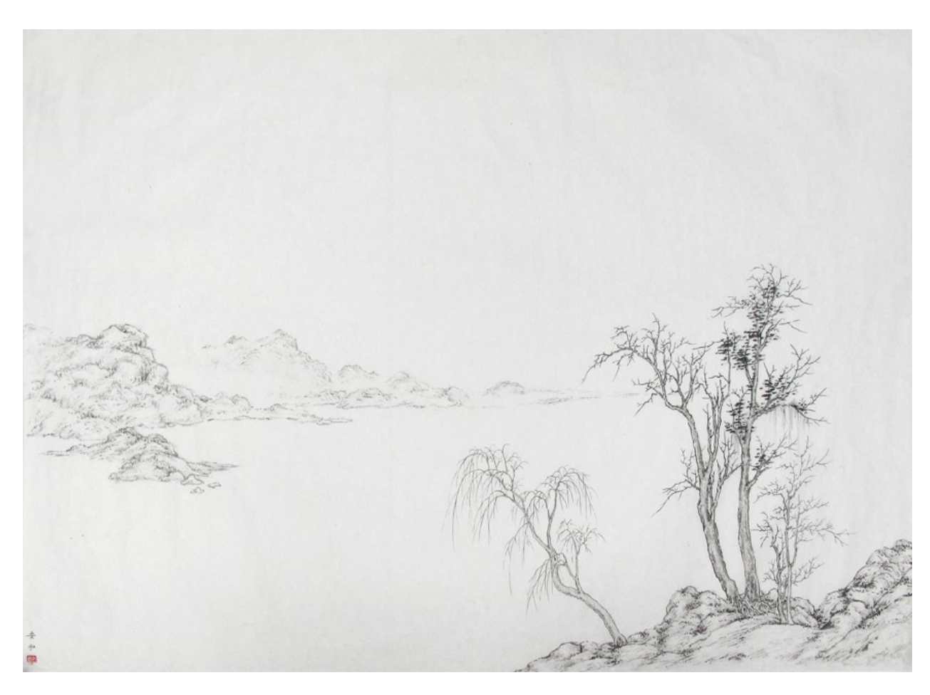
14 | An Ho (b. 1927), INK LANDSCAPE, 2007, Ink on paper, framed, 23.5 x 32.5 in [59.7 x 82.5 cm]